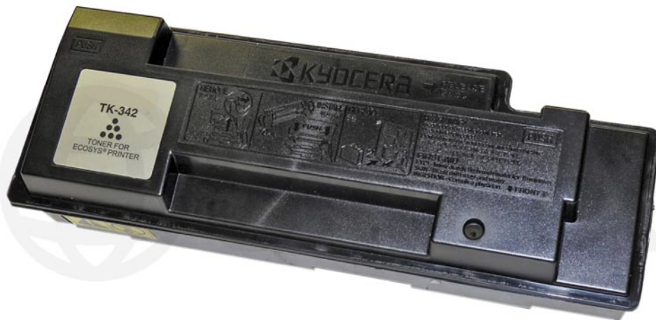
KYOCERA FS-2020 TONER CARTRIDGE